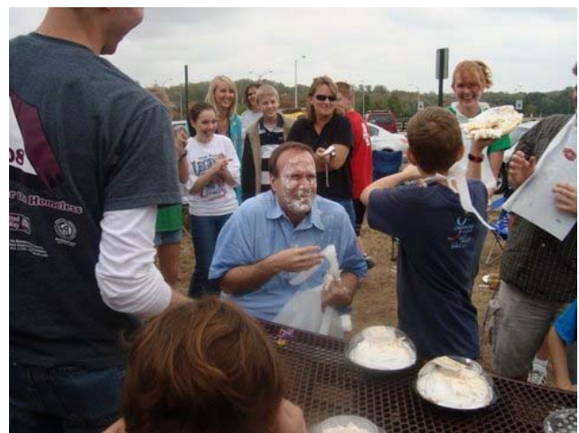
And the young at heart had a Great Time at the Parish Picnic!! See you next year!