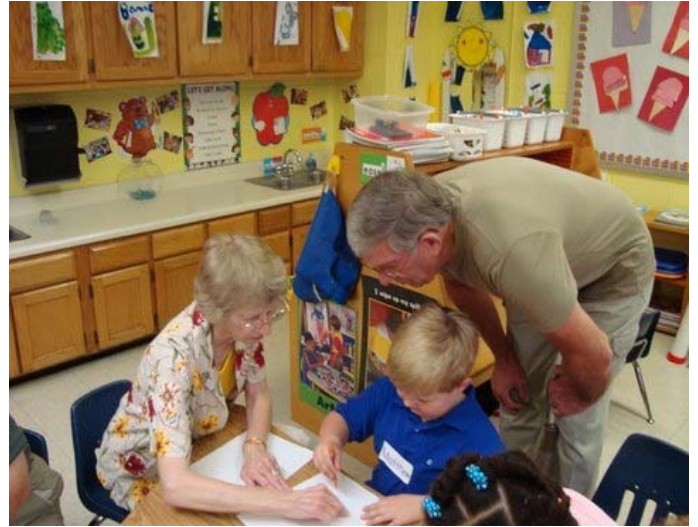
Grandparents were treated to a scrumptious lunch and tour of their Grandchildren’s classrooms!