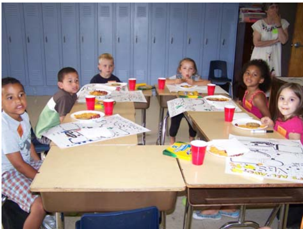
Kindergarten class..snack time!!